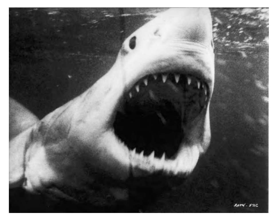
'Bruce' in JAWS

glomerates sought to renew themselves by 'attracting risk capital and creative talent which [they could] then exploit through their control of distribution',<sup>18</sup> or in the hacker analogy, the auteurs would have been the ones whose proto-types (but also failures) helped debug the Hollywood production system, as it slowly but inevitably moved from Fordist to post-Fordist modes of financing, marketing and asset management (notably studio-libraries of films, brands and various other types of intellectual property rights).