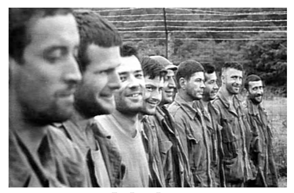
The Dirty Dozen

duty-based) motivation for the trainees and on their special, highly flexible skills at "project-oriented work", the concept of purposeful action underlying the film points towards a new, post-Fordist economy with its normalization of flexible social subjectivities.<sup>23</sup> What we can see anticipated in the film is the cohesive team-spirit and self-management of 'professional subcultures' in performing non-routine tasks (to use the language of the 'cultural turn' in post-1970 management theories), a system of production based on the 'social capital' of affective labor, tacit knowledge and undisciplined communication (to put it in terms of recent Marxist work on post-Fordism).<sup>24</sup>