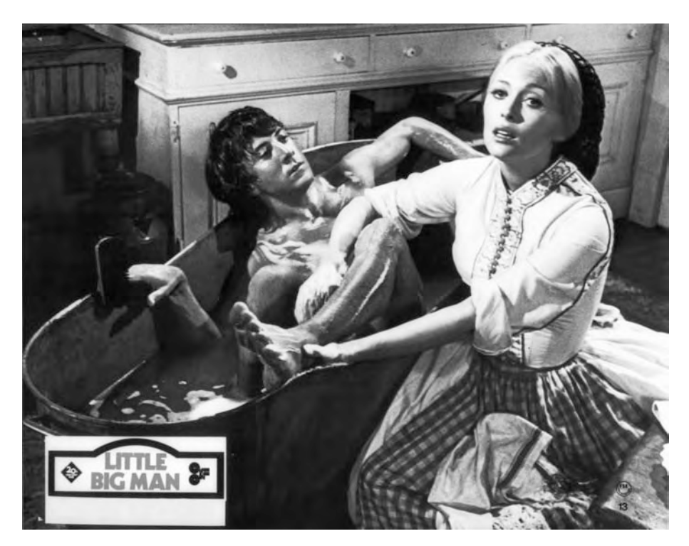
Dustin Hoffman and Faye Dunaway in LITTLE BIG MAN

(from BONNIE AND CLYDE to TAXI DRIVER); and economically, by entirely misunderstanding the willingness of a film industry – temporarily weakened by economic setbacks – to make concessions. There seemed to be no other way of resolving the dialectic between "autonomous" creativity and large investments (= expectations of profit) than by staging quasi-liberating catastrophes (from ZABRISKIE POINT to HEAVEN'S GATE). In many films of the New Hollywood era, these conflicts create a magnificent richness and enormous internal tensions and an incoherence, which lays bare their conditions of production and, consequently, the contradictions in American culture.<sup>10</sup> As Robin Wood has observed: "The films seem to crack open before our eyes."<sup>11</sup>