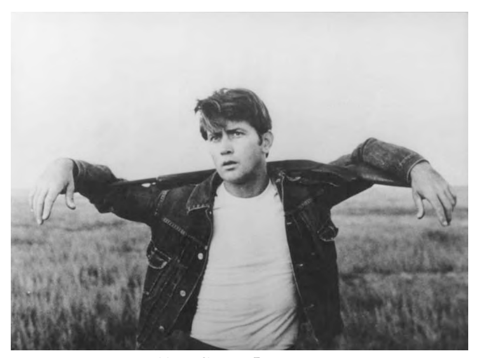
Martin Sheen in BADLANDS

the experience of war and, more often, on the experience of filming war – Coppola's Vietnam, Kubrick's, De Palma's, and perhaps Stone's, and now definitely Malick's. In this respect, there is little possibility of reading the natural images of THE THIN RED LINE naturally; they come to us as voiced, as authored. To take just one example, how when an auteur has not made a film for twenty years, is it possible to read just the nature in the new film's opening shot (an alligator that immerses itself in murky swamp water up to its eyes) and not also read for authorial voice, visual talent, this director's take on the war movie?